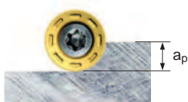
Depth of Cut (ap)